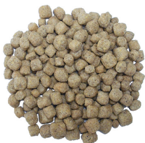
Purina® Game Fish Chow® Feed